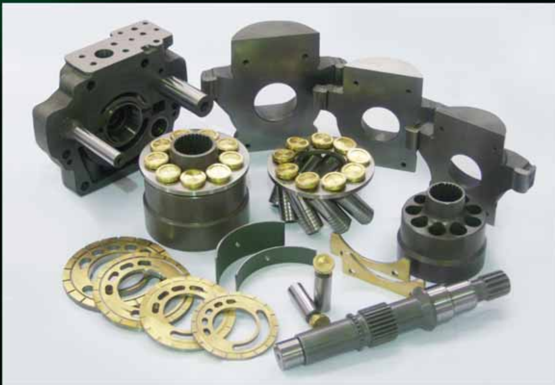
Extensive Parts Inventory for PVB, PVQ, PVE and PVH Piston Pumps.