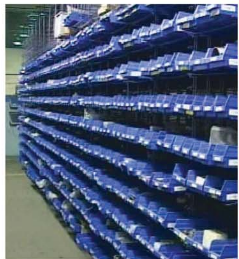
Extensive Parts Inventory