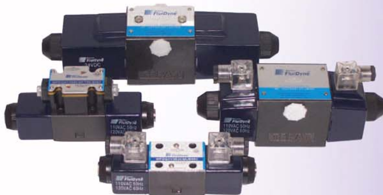
D03 & D05 Valves