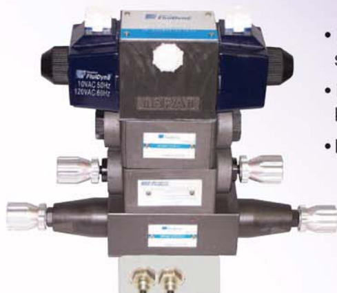
D05 Stack Valve