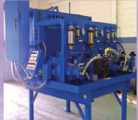
Triple Pump Test Stand

We rebuild many obsolete or discontinued valves into “Like New” condition