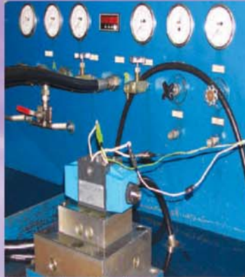
Valve Test Stand